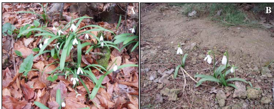
Fig. 2. Exposition of Galanthus caspius (Rupr.) Grossh. in situ (A) and in the CBG (B)

1989]. The distribution of species according to families in the study area was categorized and listed. The families which include the largest number of species are as follows: Orchidaceae (26 spp.), Hyacinthaceae (11 spp.), Alliaceae (9 spp.), Iridaceae (8 spp.) Asparagaceae (5 spp.). Families which possess less than 5 species constitute 64.13% from the floristic fund of the Hirkan National Park [SALIMOV, 2008].