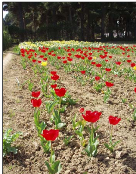
Fig. 4. Exposition of tulips in the CBG

One of the main tendencies of Central Botanical Garden of Azerbaijan are based on the selection of prospective species of plants, their introduction and study, aimed at gardening Baku City. It is also a way of conservation rare and endangered species, studying introduction and climate adaptation of decorative, medicinal, ether-oiled and other plants in order to enrich raw-material bases of plant resources. Among these groups geophytes play an important role [FARZALIYEV & al. 2006; IBADLI & al. 2006]. However, due to research data, geophytes consist of 4.25% of the flora of Azerbaijan. So, Talish floristic exposition makes a great importance in CBG [FARZALIYEV & al. 2007]. About 30 endemic and relict plants, especially trees, bushes and geophytes species have been planted here (Fig. 4).