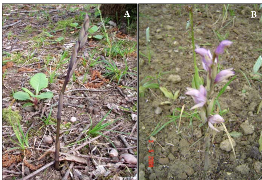
Fig. 3. Exposition of Limodorum abortivum (L.) Sw. in situ (A) and in the CBG (B)

In the research area more than 15 geophyte species are endemic plants of Caucasus or Azerbaijan. Some geophyte species are: Allium lenkoranicum Misch. ex Grossh., Allium talyschense Misch. ex Grossh., Bellevalia fominii Woronow, Ornithogalum hyrcanum Grossh., Fritillaria grandiflora Grossh., Crocus caspius Fisch. & C. A. Mey., Iris helena