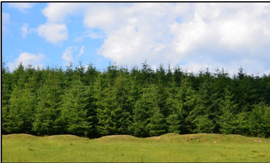
Figure 3. General aspect of the habitat (young Picea abies forest) where Choiromyces meandriformis was identified

The forest habitat (Figure 3) was characterized by a uniform and species-poor floristic composition, typical to Hieracio transsivanicus-Piceetum Pawl. et Br.-Bl. 1939 community (Table 2). Trees layer presented high cover (90%) and was dominated by Picea abies while Sorbus aucuparia , Fagus sylvatica , Betula pendula , Acer pseudoplatanus were sporadically identified. The shrubs layer (with Corylus avellana and Spiraea chamaedryfolia ) had very low cover (3-5%). Herbs layer was also species-poor, and had low cover (2-10%) with Luzula luzuloides , Salvia glutinosa , Geranium robertianum , Euphorbia amygdaloides , Veronica officinalis etc. among the most frequent species.