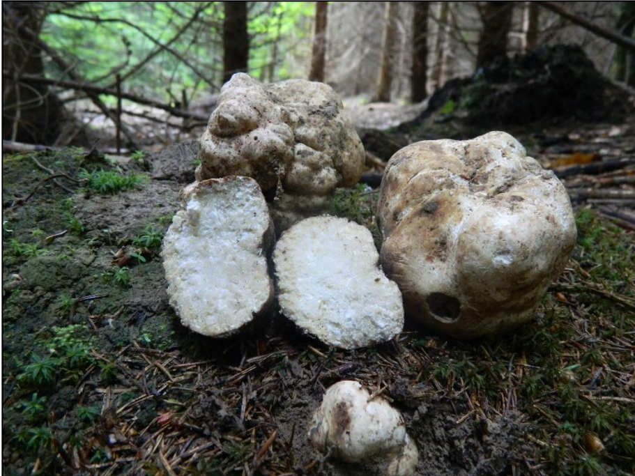
Figure 2. Macroscopic aspect of analyzed specimens of Choiromyces meandriformis

The favourable conditions for this species in Northern Romania were represented by the temperate climate, more humid during all seasons, soil characteristics and vegetation type (forest vegetation with Picea abies in different age stages). Soil analysis (Table 1) highlighted the species' preference for acidic soils (pH 5.06), with a medium content of humus, total nitrogen, potassium and total phosphorus, and a reduced amount of organic matter. These results in agreement (acid soil, wet site, spruce forest) with RODRIGEZ'S (2008) findings who identified the species (in Spain) also in acid and clay soils, in areas with increased rainfall, forming mycorrhizae with common oak ( Quercus robur L.) and spruce ( Picea abies ).