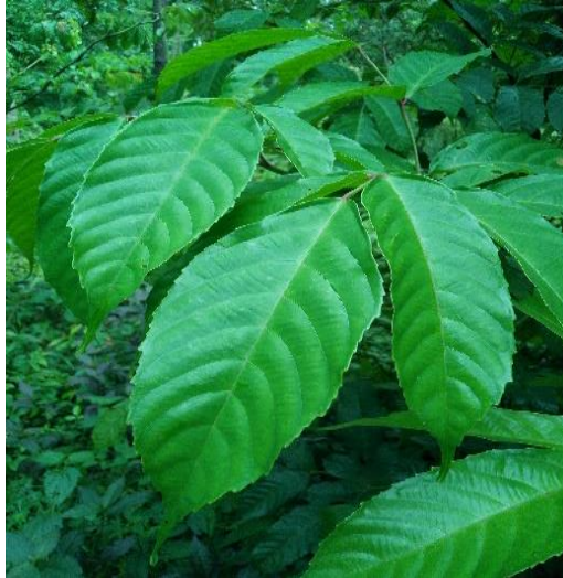
Figure 1. Leea guineensis leaves

deep green at maturity. It has a faint odor and a bitter taste. The leaf is small, cylindrical and has undulating edges. The arrangement of the leaf is in opposition. The fractured surface is non-glandular and the petiole is short. The leaf (Figure 1) is simple, opposite and entire. The venation is pinnate and its margins are smooth, apex of the leaf is acute, while the base is equal. It has a slightly hard and smooth texture with a smooth surface and spot of pink nodules. The internodes are short.