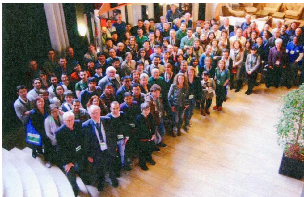
Participants at the 1 st Congress on Strigolactones, Wageningen, The Netherlands, 2015